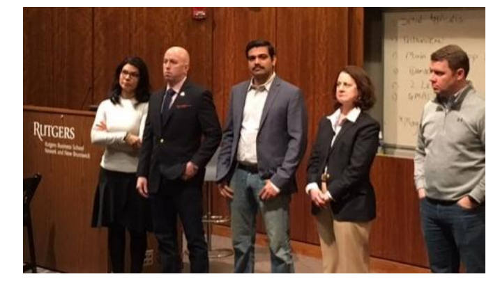
Thank you all for participating in the REMBA Open House events and sharing your invaluable insights about the program with prospective applicants!